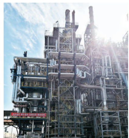
China's First Industrial Application of COSCT.

Personnel specialized in heavy ion treatment, such as frontline doctors and medical physicists, will also be trained, so as to provide more patients with the benefit of heavy ion therapy.