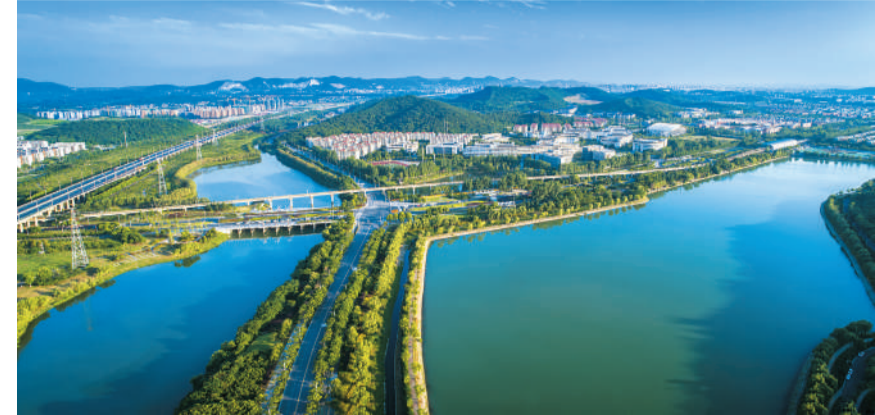
A glimpse of Xianlin University Town in Nanjing, Jiangsu province.