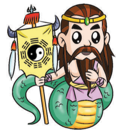
A cartoon picture of Fuxi.

Fuxi is one of the original ancestors of humankind, as well as China's first hero and one of the most powerful gods, according to Chu Silk Manuscript, which is the earliest and most complete myth before the Pre-Qin Period.