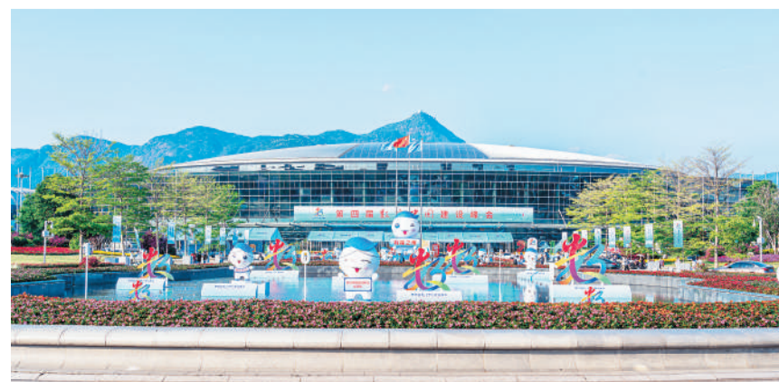
The fourth Digital China Summit was held in Fuzhou, Fujian, this April.

Enterprises will play a leading role in developing digital talents. At the same time, a data driven R&D paradigm will be explored.