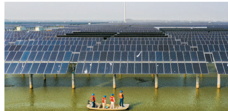
China has been boosting green development by promoting clean energy in recent years. Electricity workers patrolling amid a photovoltaic and wind power generation project installed above the fishery waters in Baoying County of Yangzhou, Jiangsu Province.