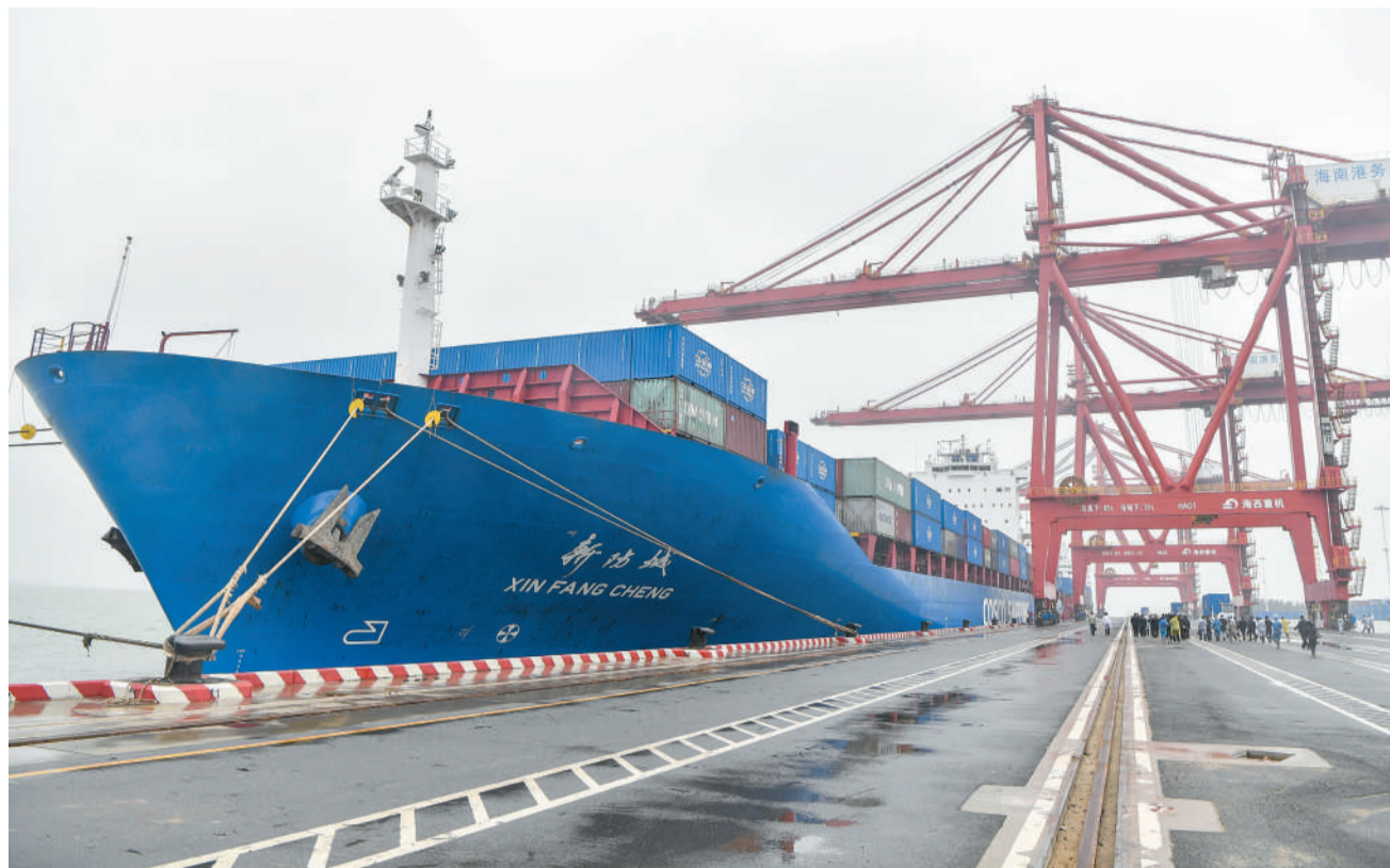
"Hainan-ASEAN (Singapore)" of COSCO Shipping.