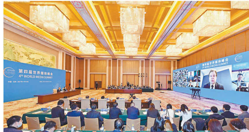
The fourth World Media Summit opens in Beijing, capital of China, Nov. 22, 2021.