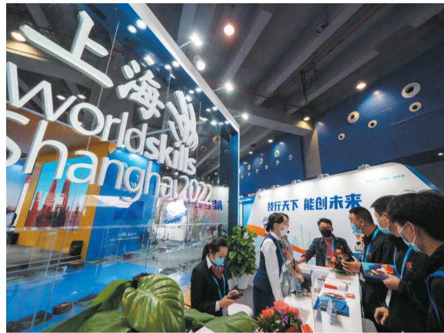
The 46th WorldSkills Competition will take place in 2022 in Shanghai.

The Luban Workshop is a typical example. Vocational schools from Tianjin have set up Luban Workshops in 18 countries to offer technical skills training to local college students. Eleven such workshops have been set up in 10 African countries, which have helped those countries develop their technical capacities.