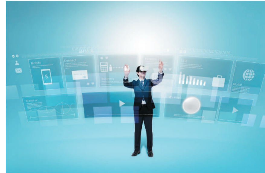
Maybe in the future, everyone can immerse in the metaverse throughout the day.

Tech Crunch writes that the Chinese government is planning to invest billions of USD and make great efforts to help China take the lead in AI,