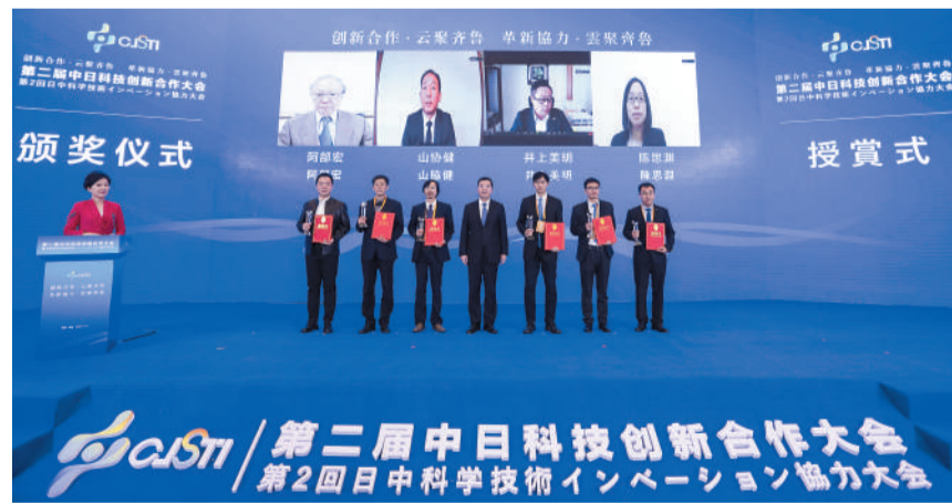
Prizes are awarded to the outstanding projects during the conference.