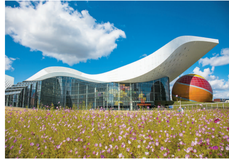
Inner Mongolia Science and Technology Museum.