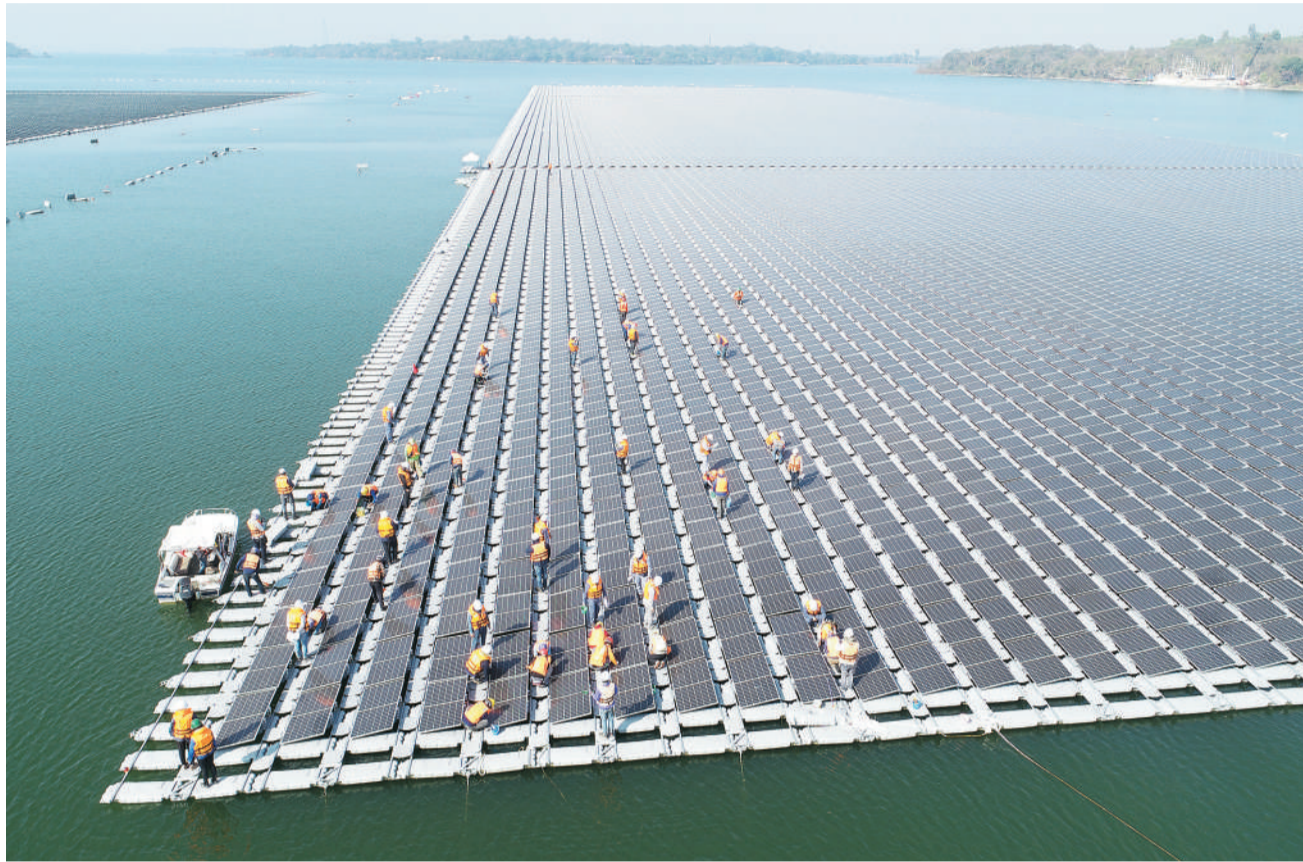
Construction workers checking the installation of floating solar panels at Sirindhorn Dam in Thailand's northeastern province of Ubon Ratchathani. The project is jointly constructed by China and Thailand.