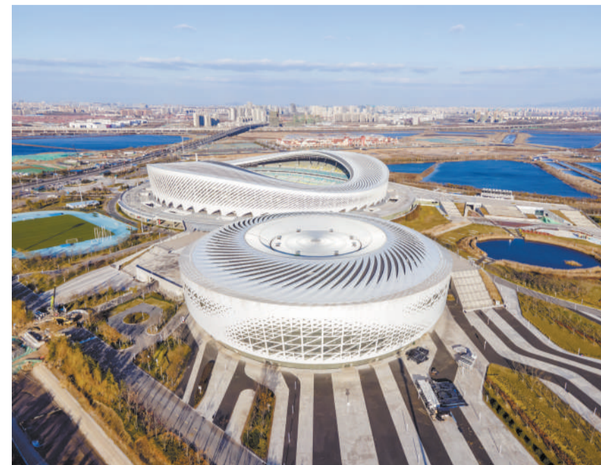
Qingdao National High-tech Industrial Development Zone

In July 2020, China decided to transform national high-tech zones into demonstration zones that facilitate innovation-driven development and pilot areas for high-quality development. To make that happen, the Torch Center has introduced an evaluation system that encourages sci-tech innovators to cluster together in the zones. It has also conducted a series of surveys with an eye towards drafting more preferential policies for enterprises.