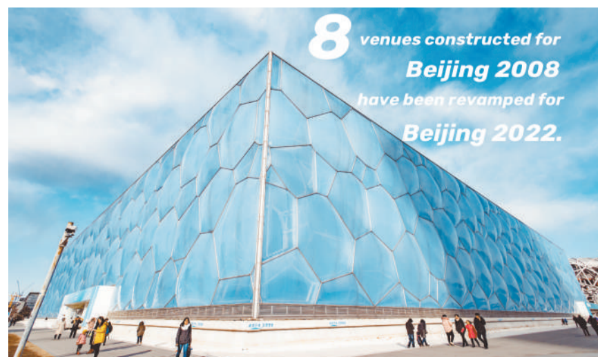
The National Aquatics Centre, known as the Water Cube, has been transformed into the "Ice Cube." (Graphic Design: TANG Zhexiao)

All the new venues use optimized construction materials and meet the three-star standard of green building. Supported by scholars in architecture and ecological preservation, a set of green evaluation standards have been developed to monitor and guide the construction and renovation of all snow sports venues. This is the first evaluation standard for green snow sports venues both domestically and internationally.