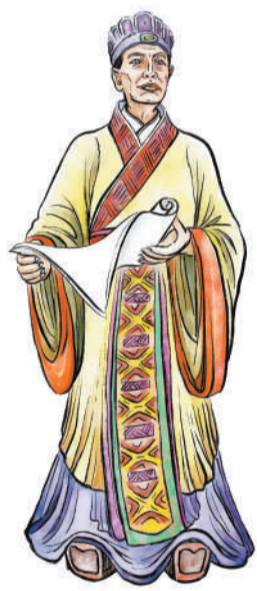
Cai Lun improves the paper-making technique during Han Dynasty.

The invention and use of paper also brought about a revolution in writing, paving the way for the invention of printing technology in the years to come.