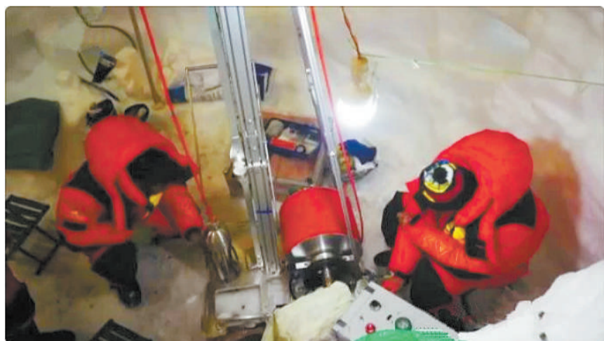
Scientists drill ice cores in the Qinghai-Xizang Plateau.

side of glaciers. Like tree rings, the ice core is a medium that can extract information about past climate and environmental changes. The material in the atmosphere is brought above the glacier by atmospheric circulation, then settles on the surface of the ice and snow, and eventually forms the ice core.