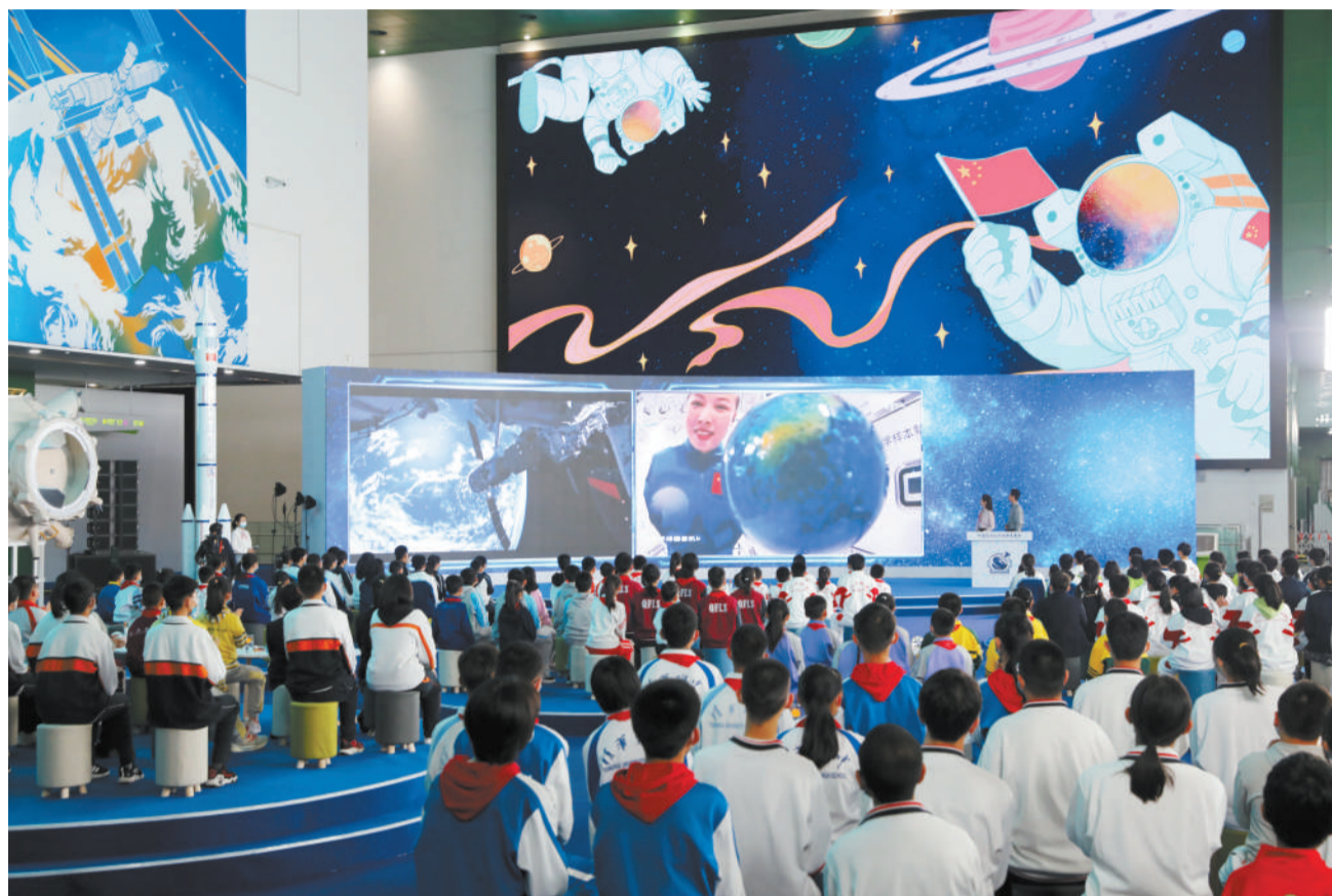
Students watching science experiment demonstrated by the Shenzhou-13 crew members, at the China Science and Technology Museum in Beijing, Dec. 9, 2021.