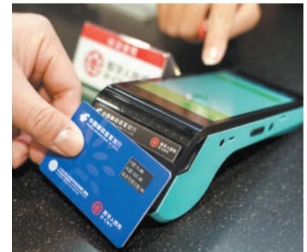
A staff member shows a digital 'hard wallet' in Shanghai Jiao Tong University.