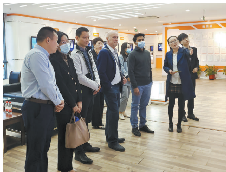
Foreign sci-tech commissioners exchange view on the scene.

Another student from the first "space class" is devoted to popularizing space knowledge through videos, so that more people can experience a part of China's manned space program.