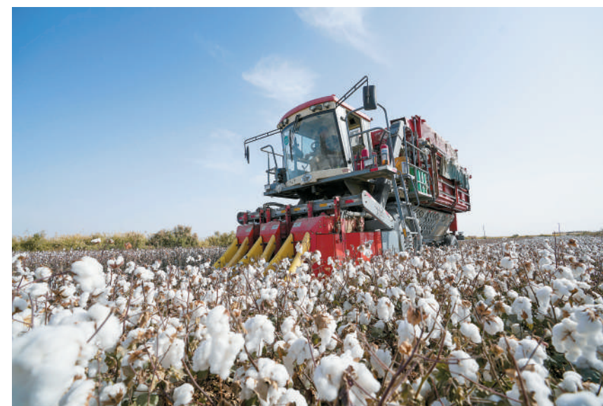
A cotton picker works in fields in Yuli County, Xinjiang.

By 2035, China will put in place a cultural relics protection and management system commensurate with the goal of developing the country into a cultural power, and the development of sci-tech innovation personnel will provide strong support for the protection, research and utilization of cultural relics.