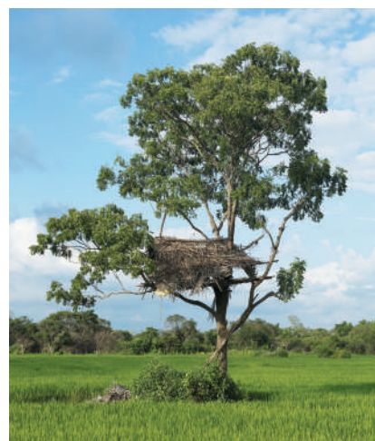
A tree house. (PHOTO: VCG)

In the history of Chinese civilization, Youchao took this vital step to help distinguish humans from animals.