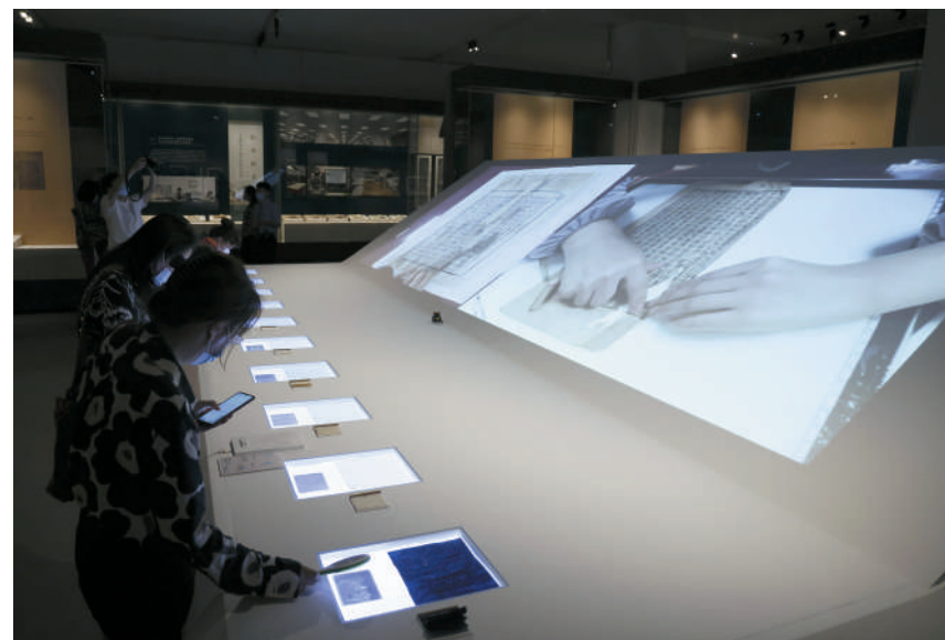
An exhibition of ancient books restoration achievements.

Sci-tech innovation will inject strong impetus into the region's high-quality development, and lay a solid foundation for a beautiful, healthy and safe Xinjiang, says the plan.