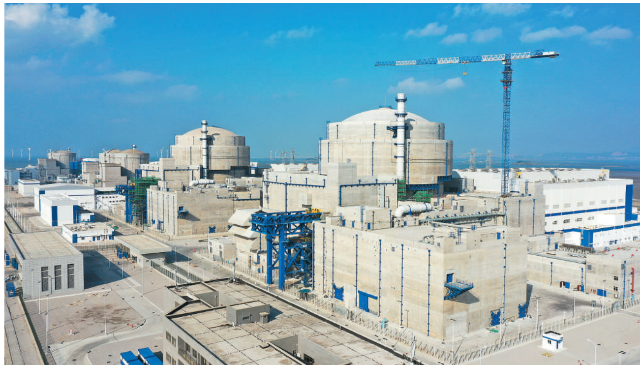
Fuel loading has started at China's second nuclear power unit using Hualong One technology, after the first one entered commercial operations earlier this year.

China will also inject impetus into economic recovery and sustainable development in the Asia-Pacific, and strive to build a global community of development with a shared future, he noted.