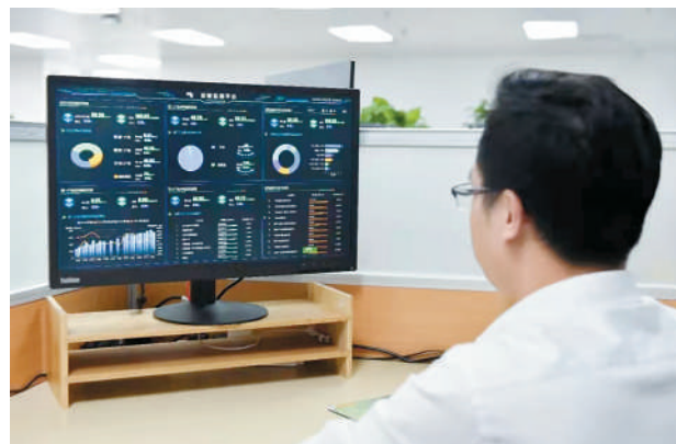
Dual carbon brain.

Wang Zhengsi, deputy director of application support department of SPSB's information Center, said that the system will provide multiple services such as energy consumption detection, index display, and problem location. Meanwhile, it may become a significant system to provide energy consumption monitoring and