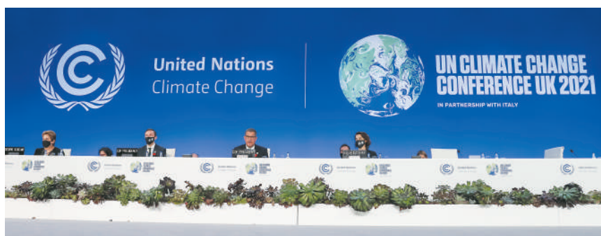
The closing plenary of COP26 to the United Nations Framework Convention on Climate Change in Glasgow, Nov. 13, 2021.

COP26 is the first climate change conference after the five-year review cycle under the Paris Agreement inked in 2015. COP27 will be held next year in Egypt with updated plans on how to slash greenhouse gas emission by 2030.