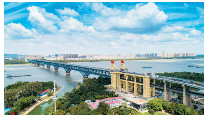
Nanjing Yangtze River Bridge is a famous bridge that spans across the Yangtze River in Jiangsu province.

In addition, China has established a carbon capture, utilization, and storage entrepreneurial technology innovation strategic alliance, along with a special committee and other institutions, to promote technical progress and the application of scientific and technological achievements in the field.