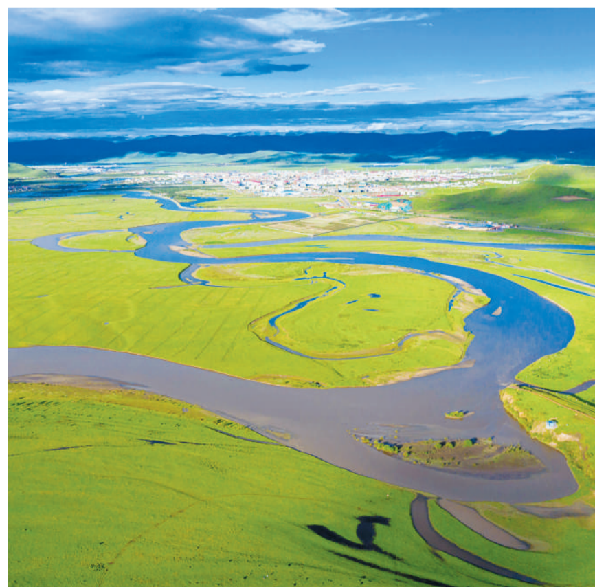
Baihe River is located in the Sichuan Basin, southwest China.

The People's Bank of China (PBOC), the nation's central bank, said on November 8 that it has rolled out a supporting tool for carbon reduction to facilitate the country's goal of carbon neutrality.