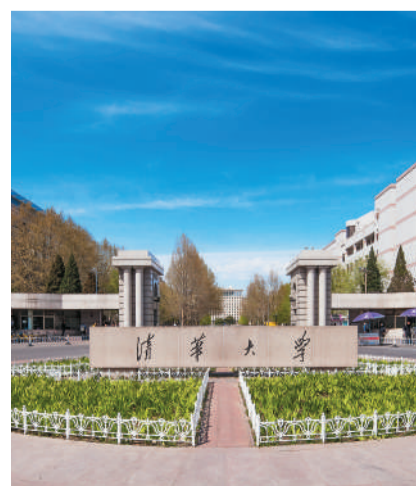
Tsinghua University

the U.S. believe America's science and technology strength could be undermined by toughened U.S. visa requirements that are restricting the flow of academic talent from China.