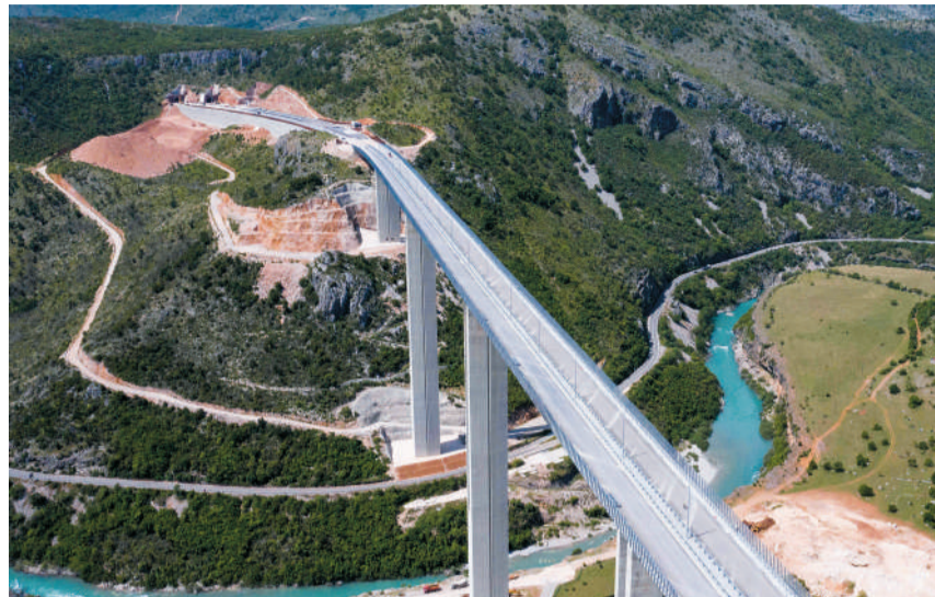
The aerial views of Montenegro's highway built by China.

Journalist Ralph Jennings said on the Voice of America, that green energy is the new focus of China's one-of-a-kind BRI, aiming to build a series of in-