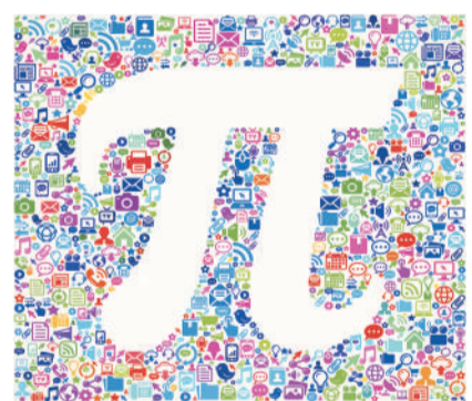
A picture of Pi.

There is an asteroid in the vast night sky and a crater on the dark side of the moon, both of which are named