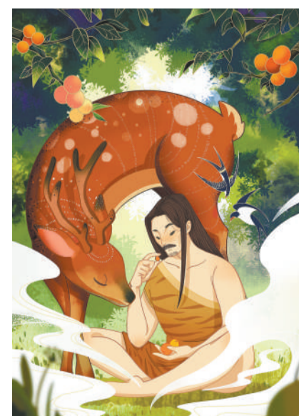
A creative picture of a legendary divine farmer: Shennong

Over the centuries, there have been many versions of the story of Shennong. However, by all accounts, because of his efforts, countless herbs are now used in traditional Chinese medicine and the importance of traditional herbs are now widely accepted.