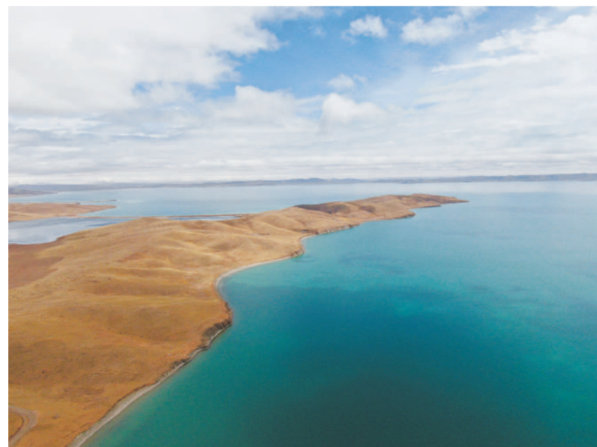
Aerial photo taken on May 25, 2021 shows a view of Noring Lake in the Sanjiangyuan National Park in Golog Tibetan Autonomous Prefecture of northwest China's Qinghai Province. The ecological system has been steadily improving in recent years in the Sanjiangyuan National Park, making it a habitat of an increasing number of wild animals.