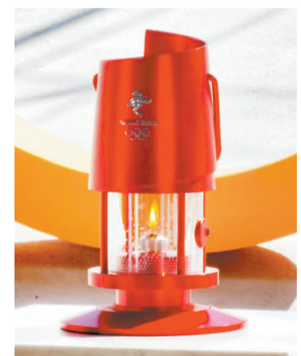
The kindling lamp of the Beijing 2022 Winter Olympics adopts the appearance of the Gilt Bronze Human-Shaped Lamp.

In order to solve these problems, team members utilized the double-layer structure and opened up space from top to bottom entirely so that when there is air pressure on the top of the lamp, the carbon dioxide exhaust in the chamber can be smoothly discharged from the sidewall space.