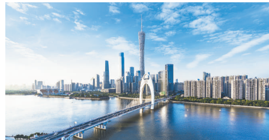
Canton Tower, at the south bank of the Pearl River, is the landmark of Guangzhou city.