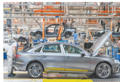
A worker is assembling a car in the workshop of FAW-Volkswagen Automobile in Changchun, Jilin Province, northeast China, April 2, 2021.